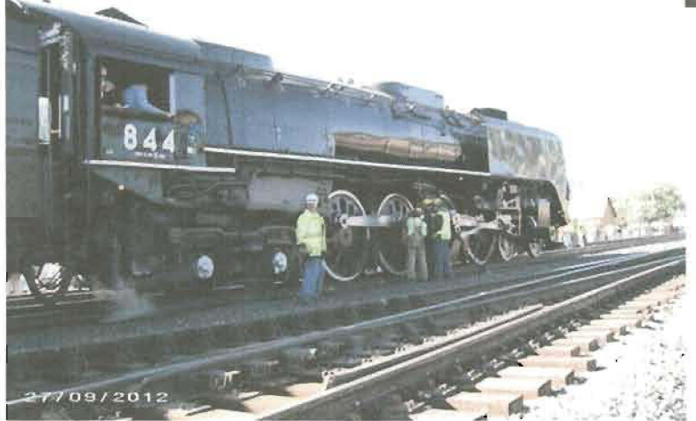
The 844 crew services the engine during its stopover in Truckee.

Student Rail Fans came in droves with their parents and teachers to see 844 steam into town. The Truckee Donner Rail Road Society had provided in-class teaching about Truckee rail road history as well as history of the 844 and encouraged the students to come and see this "living" legend.